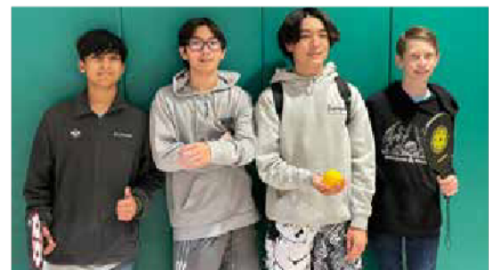
GBC Jr Y Pickleball competitors