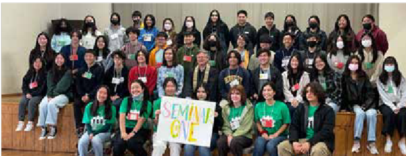
At the SD Jr YBL Seminar 1 "Buddhism By the Border" co-hosted by San Diego & Vista Jr Y.

The GBC Jr Y. is looking forward to March 4 with SD Jr YBL Seminar 2 "Buddhism in Nature" co-hosted by Senshin, Oxnard and Pasadena Jr Y.