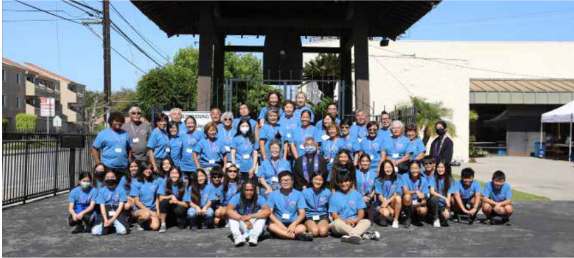
2022 Wisteria Chugakko Students & Staff

Please join us for the 2023 Wisteria Chugakko Summer Program. The program is for students going into the 7th, 8th or 9th grade in the Fall of 2023. Please speak to your children, grandchildren and friends to join us at Gardena Buddhist Church next summer. We are now accepting 2023 Student Interest Forms.