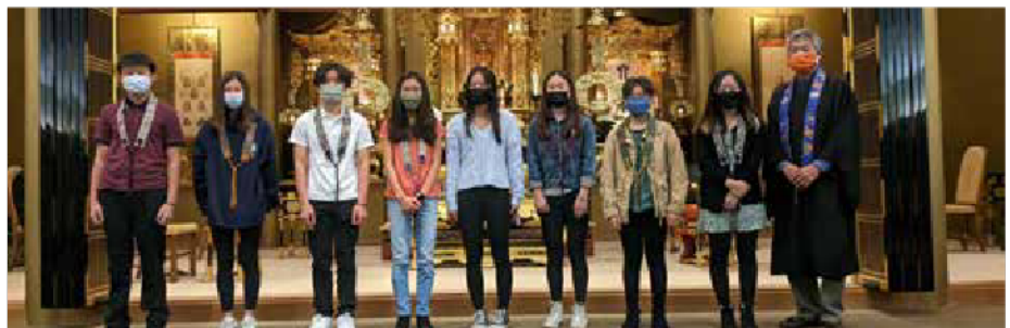
Sangha Teens 2023 Cabinet