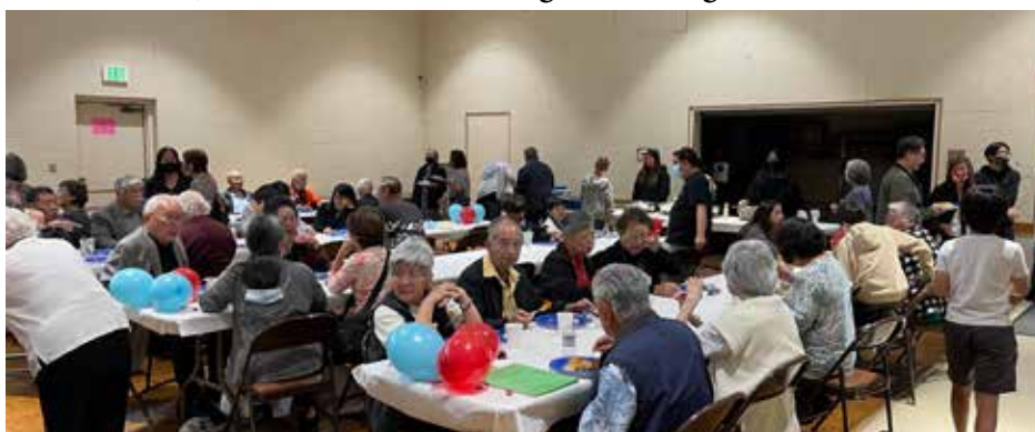
Everybody enjoyed the Father's Day Luncheon!