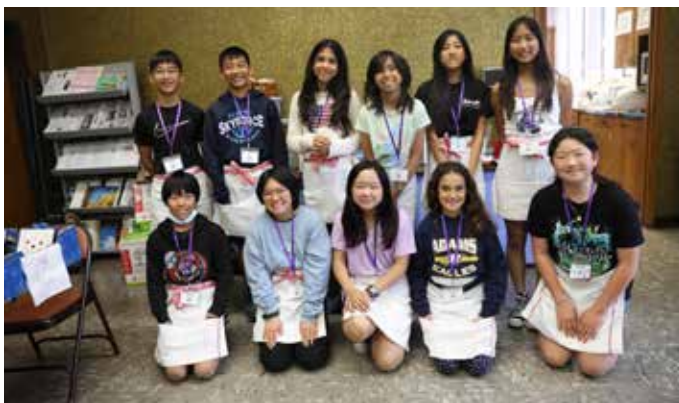
Sewing Class - Apron