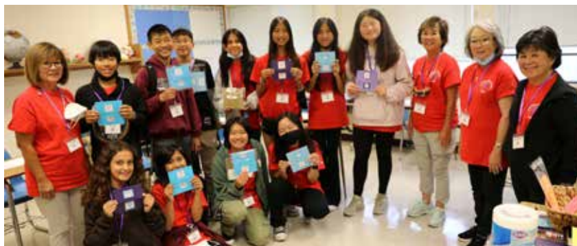
Card Making Class