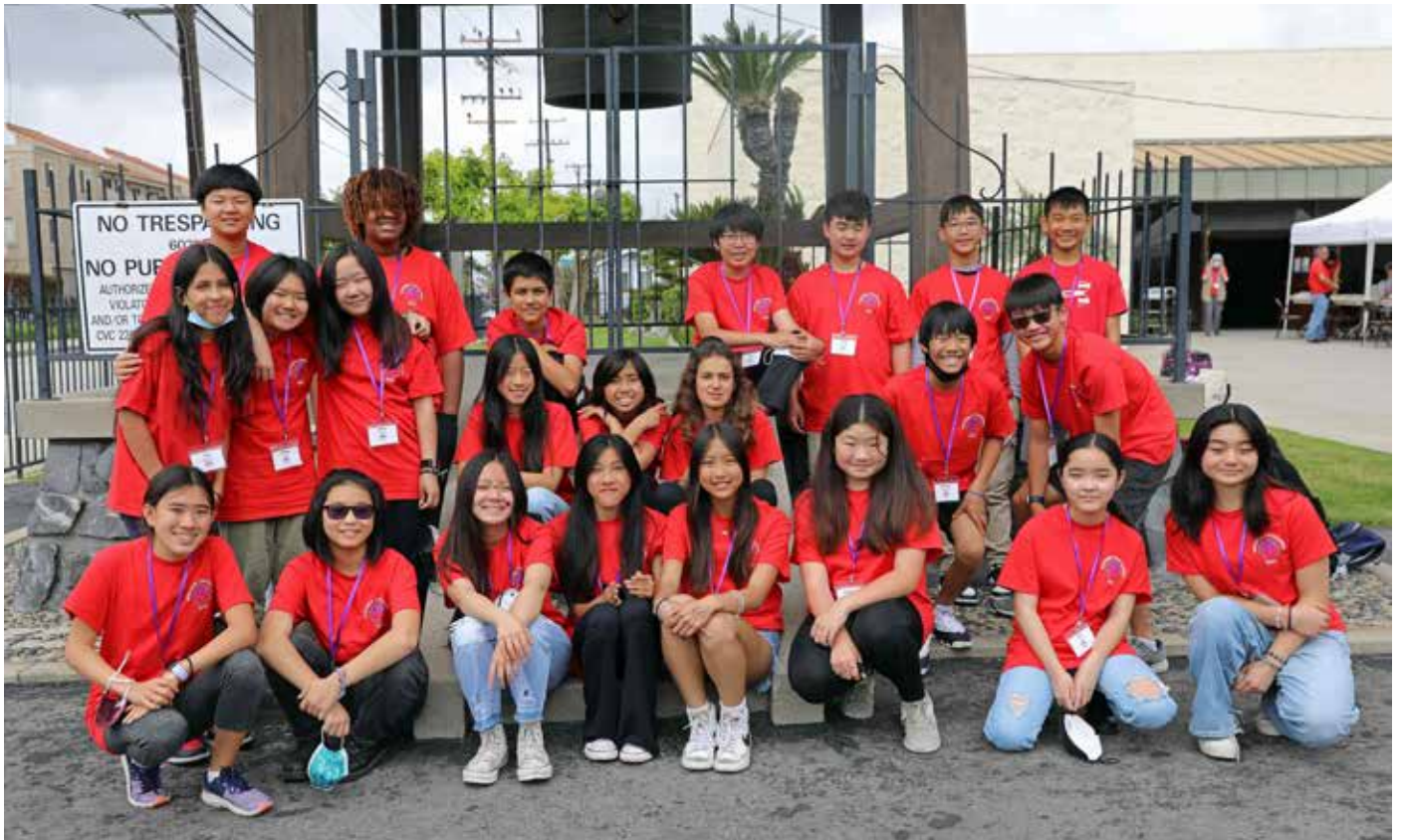
2023 Wisteria Chugakko Students