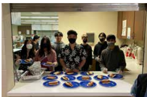
Jr. YBA members working the hot dog luncheon