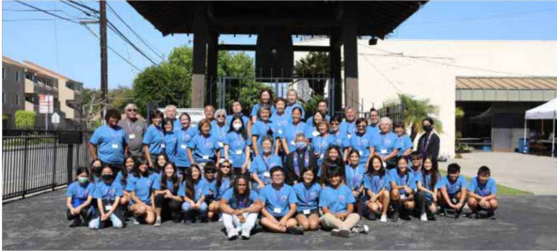
2022 Wisteria Chugakko Students & Staff

Please join us for the 2023 Wisteria Chugakko Summer Program. The program is for students going into the 7th, 8th or 9th grade in the Fall of 2023. Please speak to your children, grandchildren and friends to join us at Gardena Buddhist Church next summer. We are now accepting 2023 Student Interest Forms.