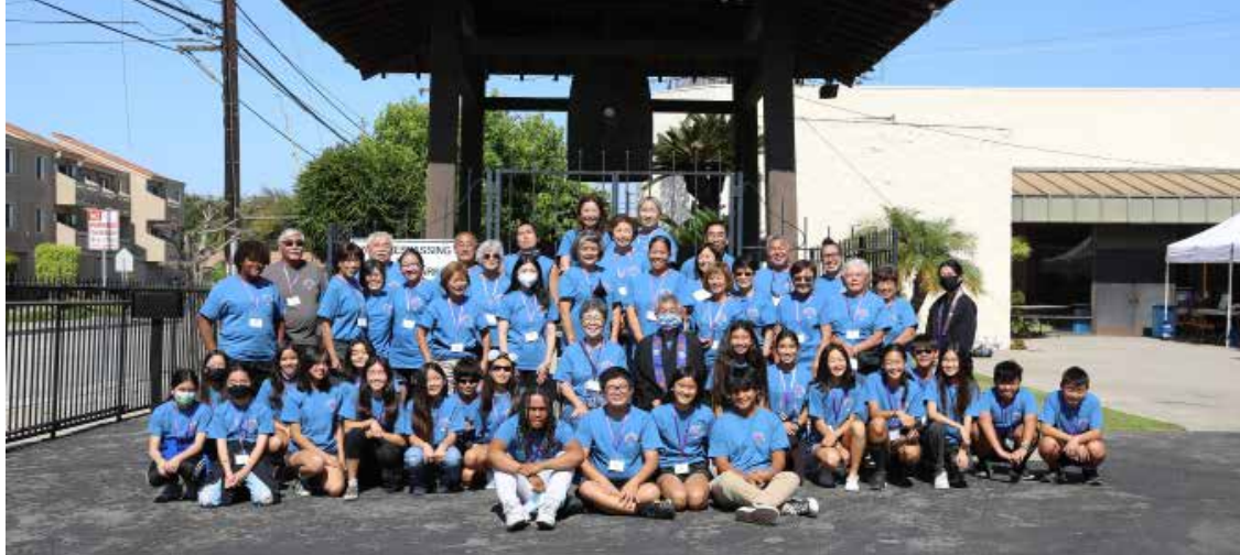
2022 Wisteria Chugakko Students & Staff

Please join us for the 2023 Wisteria Chugakko Summer Program. The program is for students going into the 7th, 8th or 9th grade in the Fall of 2023. Please speak to your children, grandchildren and friends to join us at Gardena Buddhist Church next summer. We are now accepting 2023 Student Interest Forms.