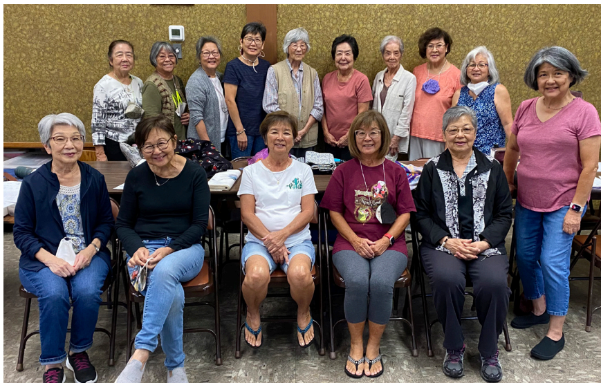
A group photo of our CPG in October, 2023

Our CPG is made up of volunteers who meet regularly at church, gathering to share ideas and work on projects to donate/sell to others. We welcome anyone interested in joining us. Please contact any of our members if you are interested.