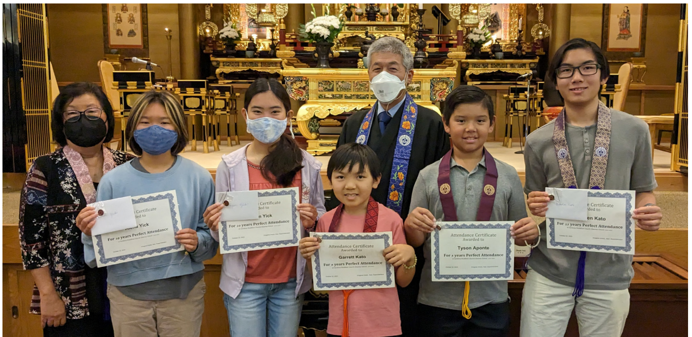
Dharma School "2023 Perfect Attendance" awardees

Board Meeting: Wednesday, December 13 at 7PM Via Zoom