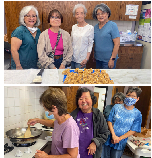
Members at work making "Okoshi" November, 2023