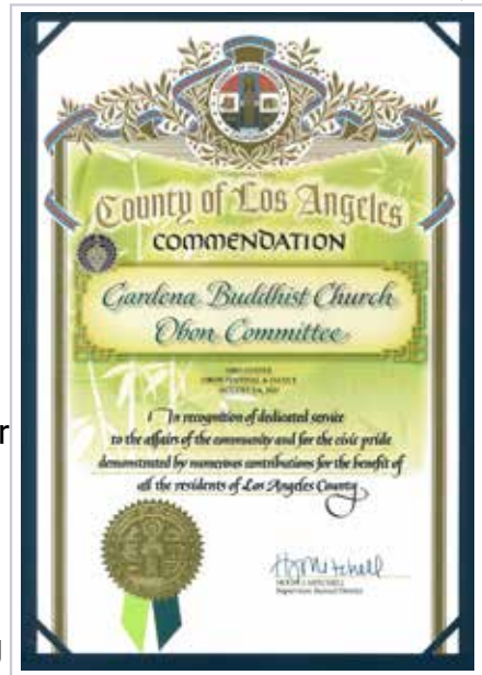
Commendation from County of Los Angeles

To all of you who came out to help, I’d like to extend a BIG THANK YOU! I know that it was a really hot weekend and there were probably places you’d rather be or things that you’d rather be doing but without you, this celebration would not have been possible.