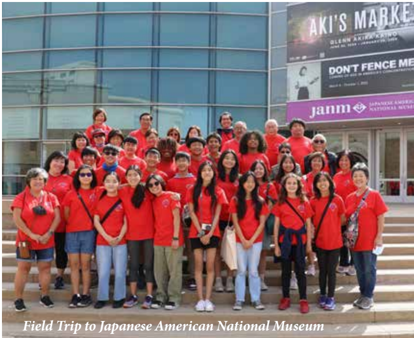
Field Trip to Japanese American National Museum