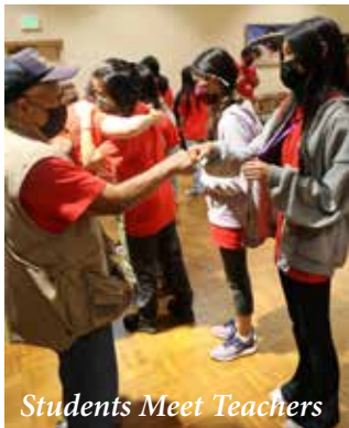
Students Meet Teachers