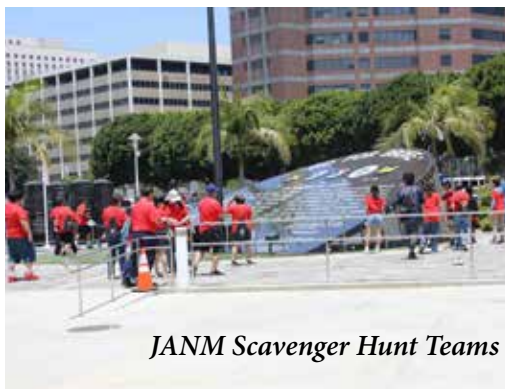
JANM Scavenger Hunt Teams