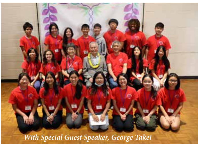
With Special Guest Speaker, George Takei