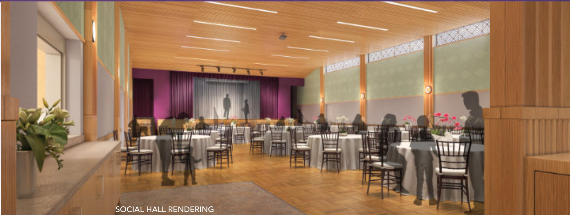
SOCIAL HALL RENDERING