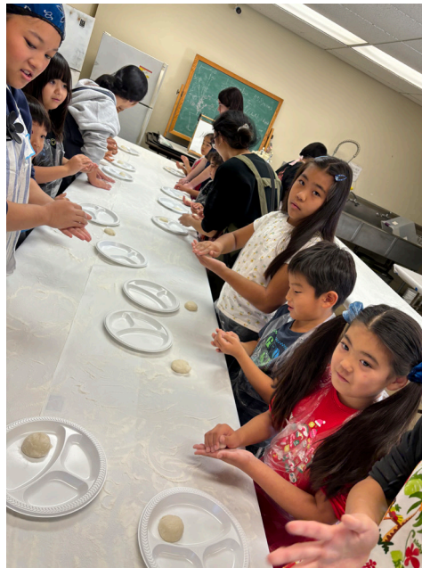
Nakayoshi Preschool held Mochitsuki Taikai on Saturday, December 16th.

Students had a great time to experience one of the Japanese traditional events around this time of the year.